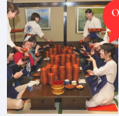
Wanko soba noodles