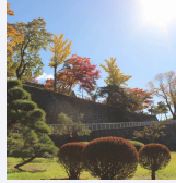
castle ruins park