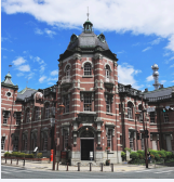
Red brick building